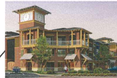
PEDESTRIAN NODES - Benches - Lighting - Scored and toned paving