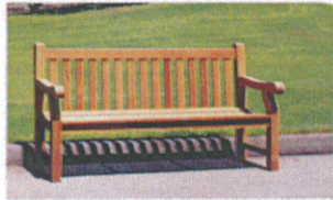
SEATING - Benches - Located on all sides of plaza