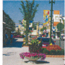
STREETSCAPE - Street trees - Pedestrian scaled light fixtures - Flowering plants - Scored and toned concrete paving