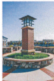
PLAZA GATHERING SPACE - Seating - Flowering plants - Focal point lighting